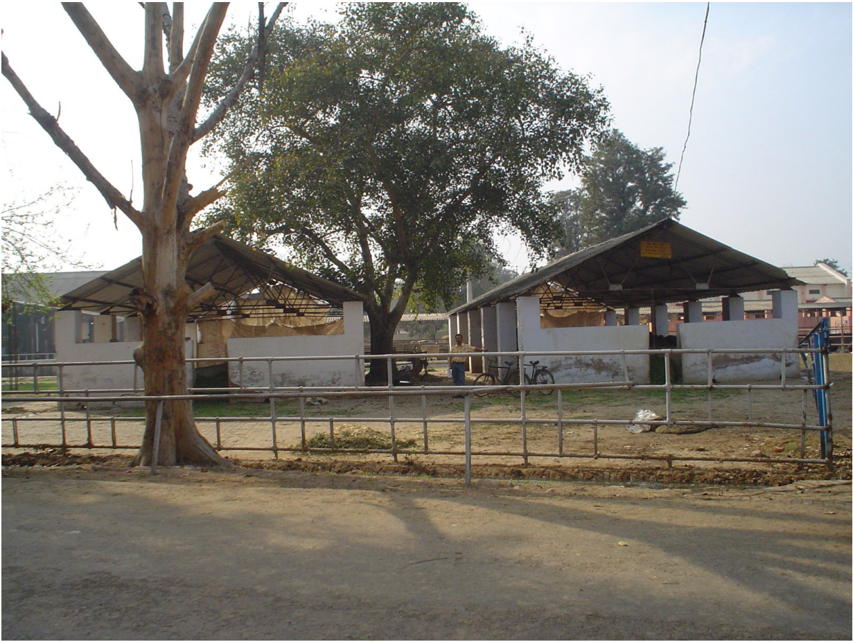
Fig. 1. Housing of the experimental cows