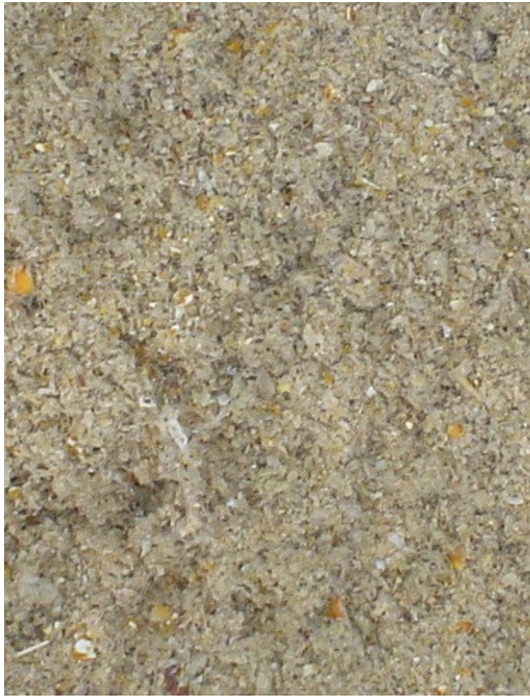
Fig.3. Appearance of concentrate mixture based on Bt cottonseed