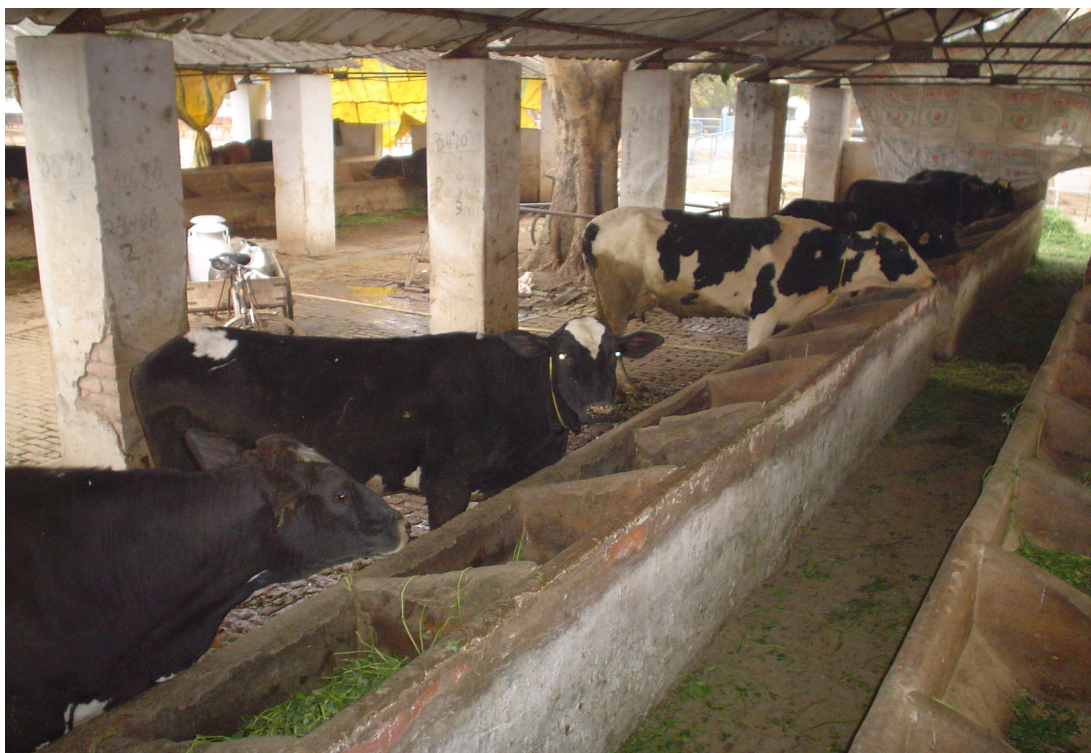
Fig. 2. Arrangements for individual feeding of crossbred cows

replaced with similarly processed Bt cottonseed, supplied by the same firm. Composition of both types of concentrate mixtures containing Non Bt and Bt cottonseeds is given in Table 2.